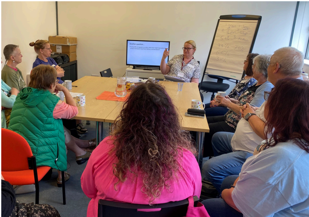
[Image shows a group of people sitting around a table facing the lipreading teacher who is sitting in front of a TV screen and white board.]

We ran some group sessions with presentations from a Lipreading Teacher, the Fire Service and an equipment specialist in equipment. We will be running more sessions from February 2025 so watch this space!