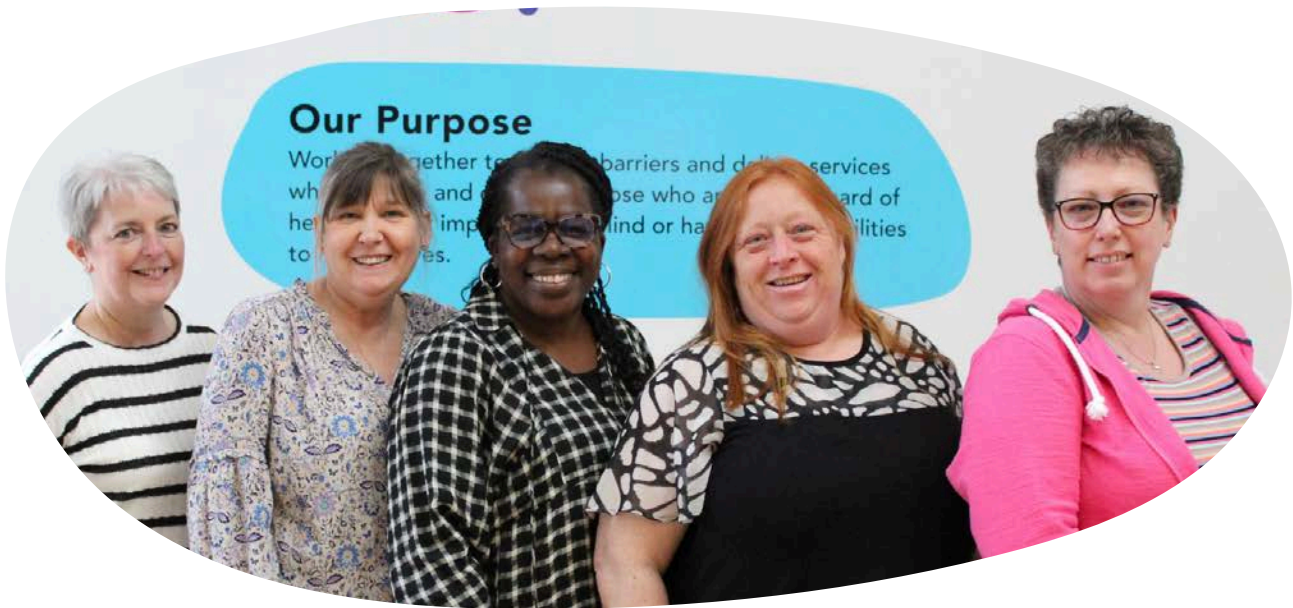
Image shows five women standing side by side in front of a colourful BID services sign